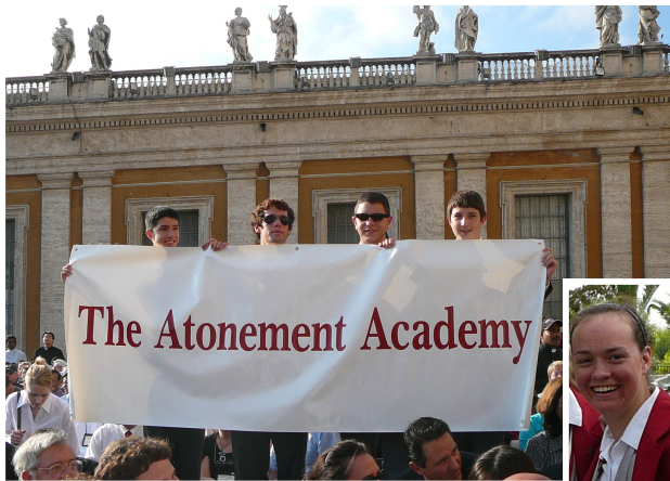
September 2007: Upper Scholars pilgrimage to Rome, Assisi and Pompeii

In between these serious things, you will have fun, play sports, attend dances, and participate in student clubs and activities.