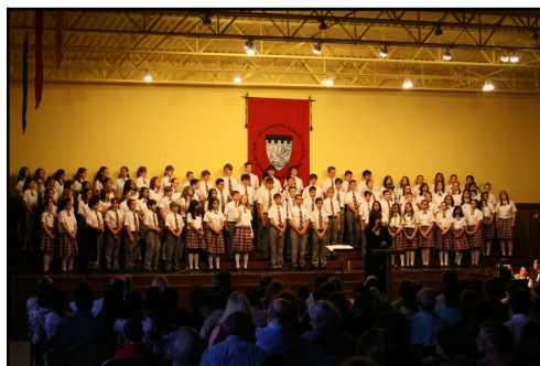
Treble choir performs at the Spring '08 Concert